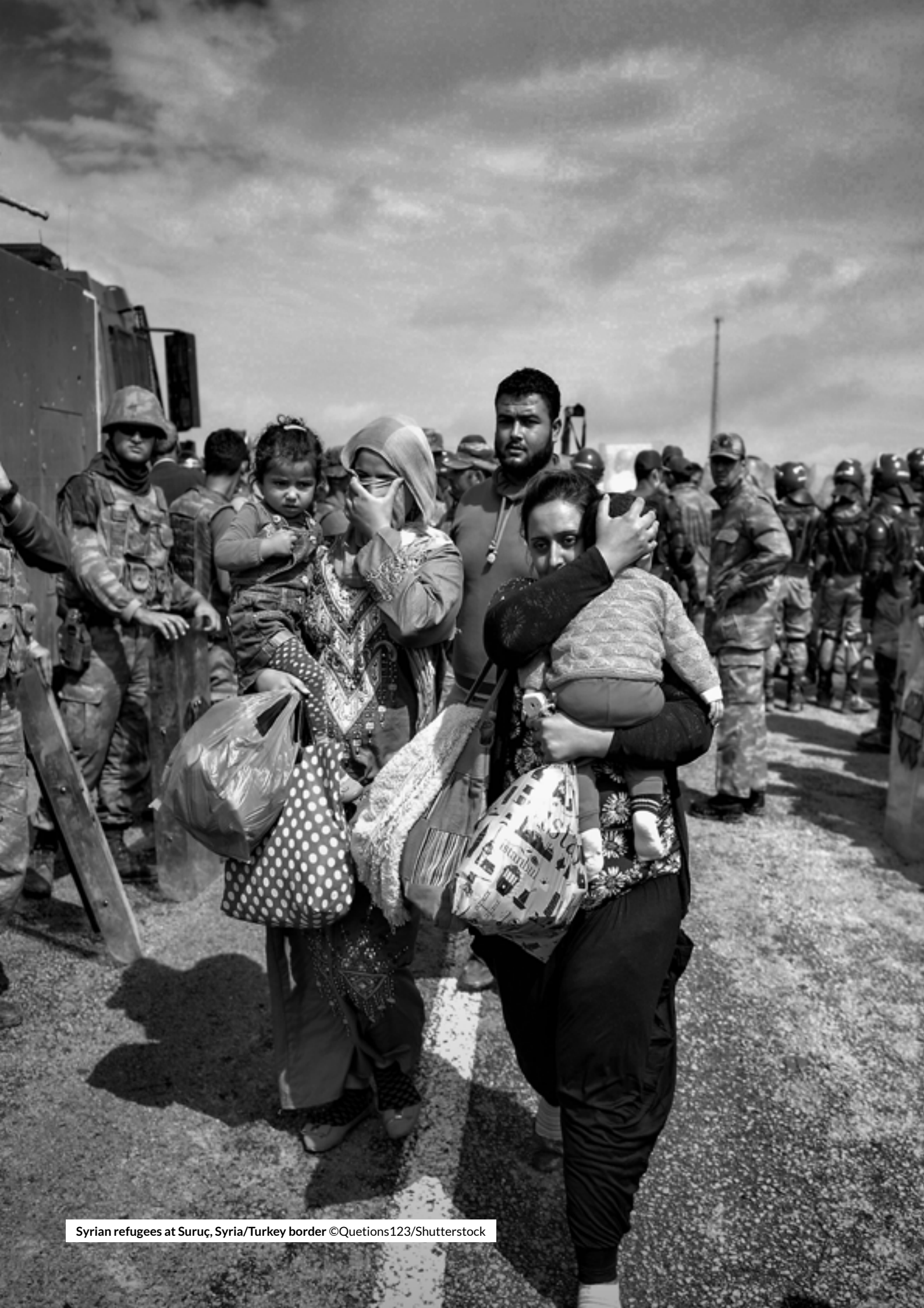
Syrian refugees at Suruç, Syria/Turkey border