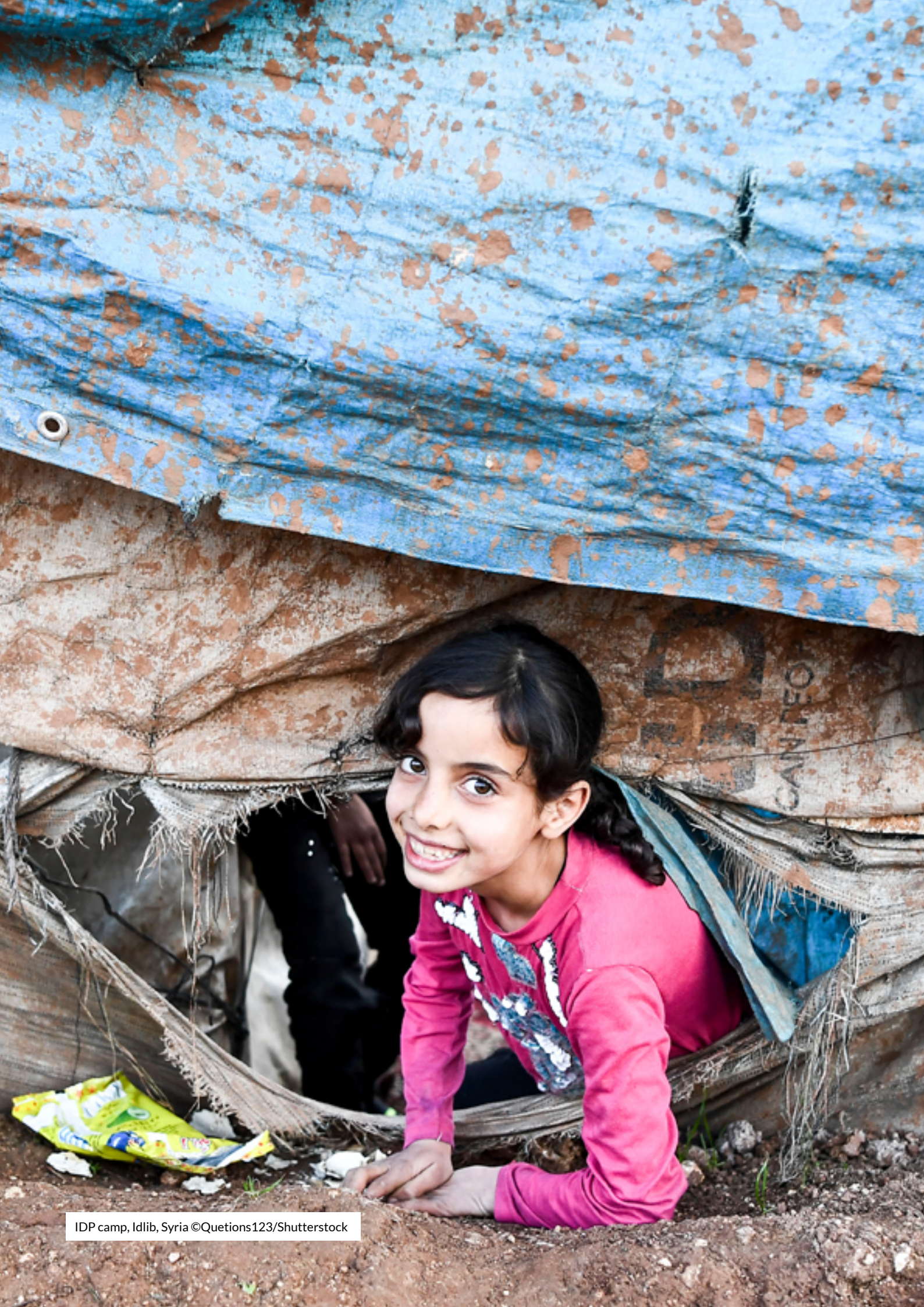
IDP camp, Idlib, Syria