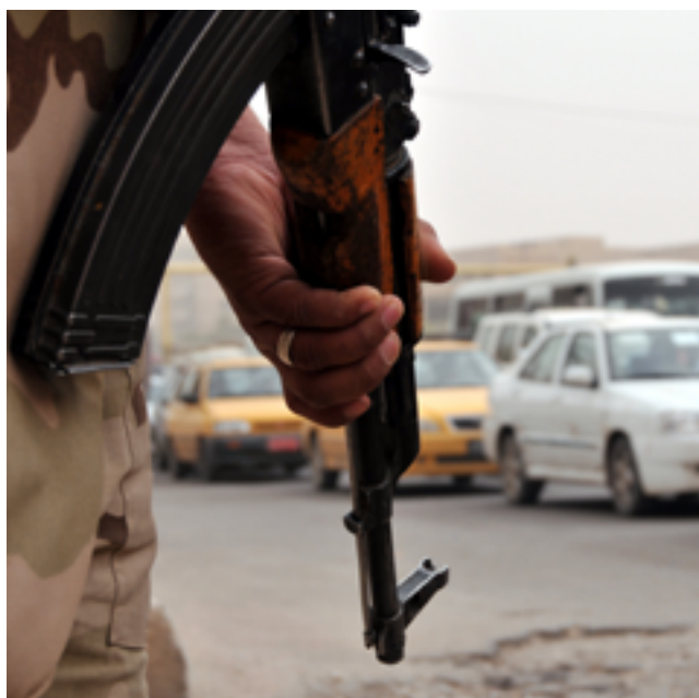
Baghdad roadblock