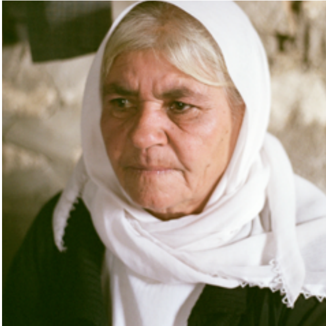
Nineveh, Iraq

civilians first. Rather than seeing them as helpless victims, or the collateral damage of war, we believe in recognizing their agency, and promoting their participation in measures to assist and protect them. Above all, it means realizing their rights.