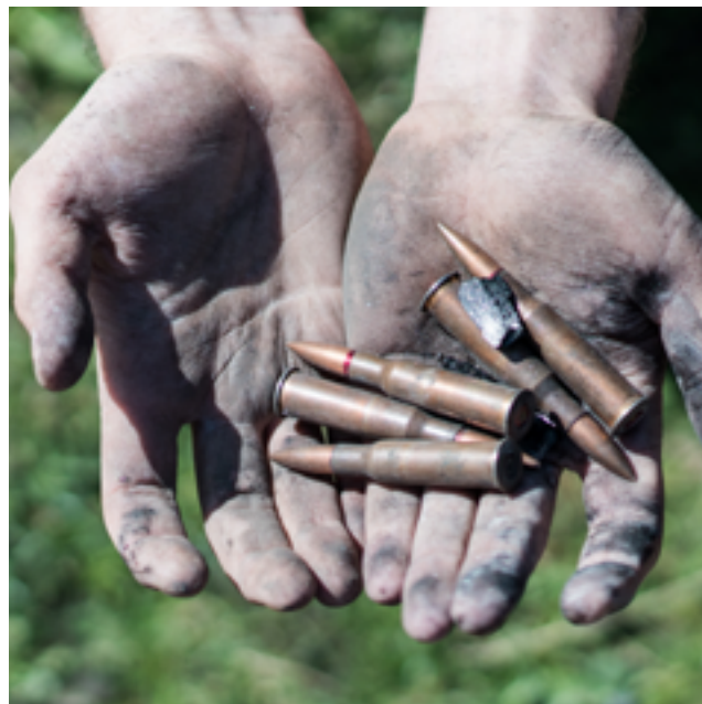
In northern Syria, Ceasefire has trained judges and legal monitors in the law of the Geneva Conventions.

The effective implementation of international law depends on regulation, training and military accountability mechanisms keeping up to date with the changing face of warfare. Developing and promoting policy responses based on civilian rights will support real improvements to civilian protection on the ground.