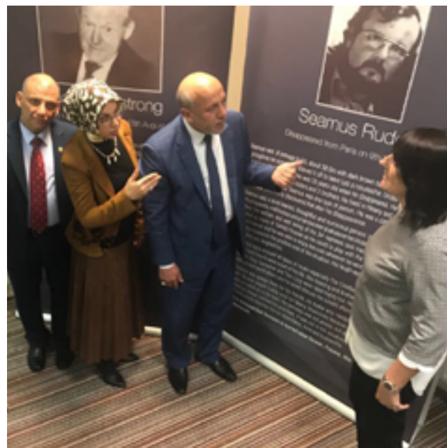
Ceasefire is advising MPs in Iraq on new laws to deliver justice for the disappeared and for survivors.

Ceasefire aims to optimize existing technologies, working with leading non-profit technology providers to make the best of available tools to support civilian-led