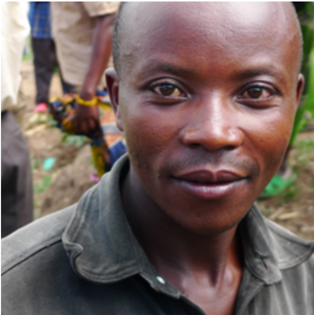
Kivu, DRC @Lattimer

Objective 2: To seek justice and accountability for violations of civilian rights