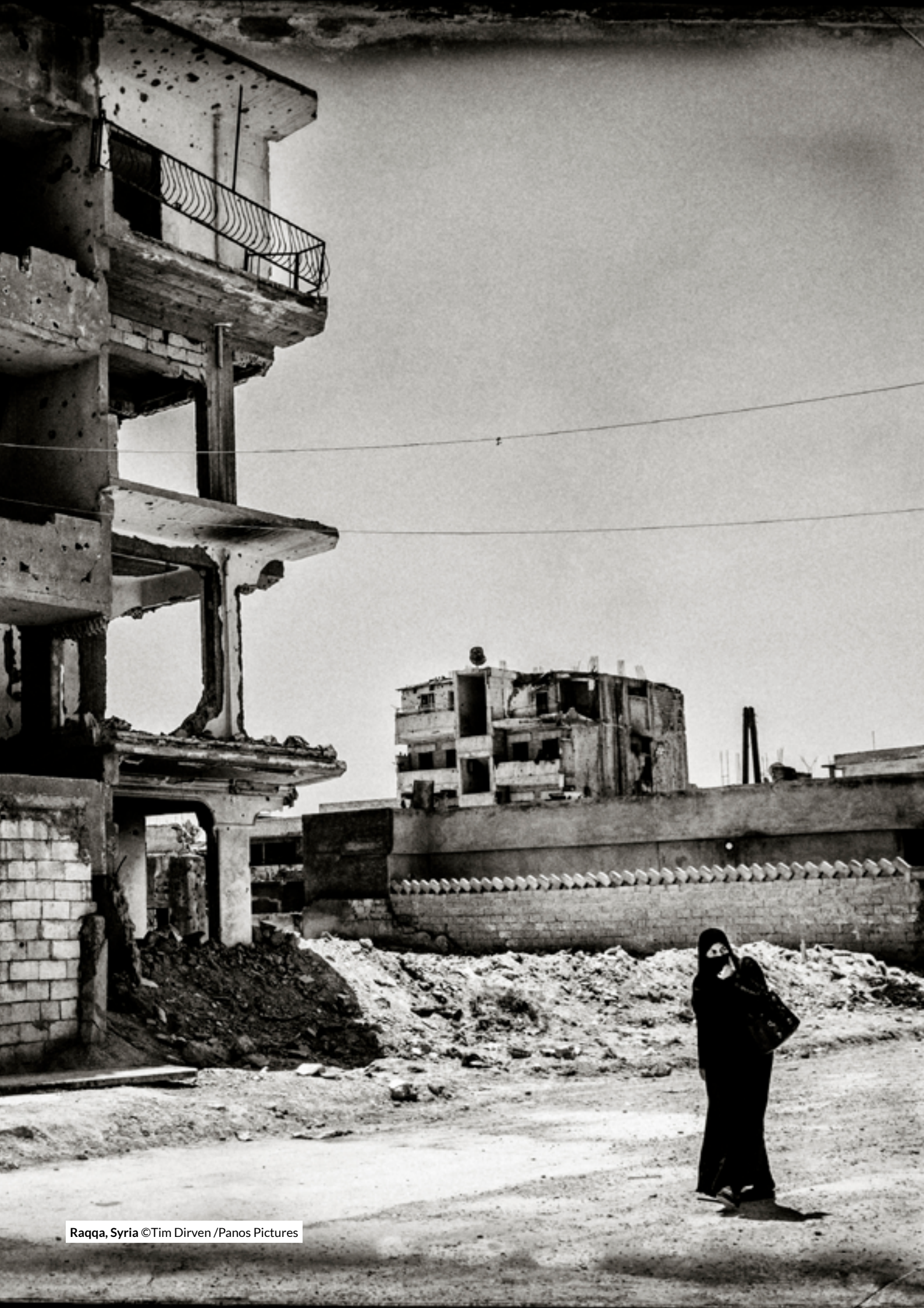
Raqqa, Syria